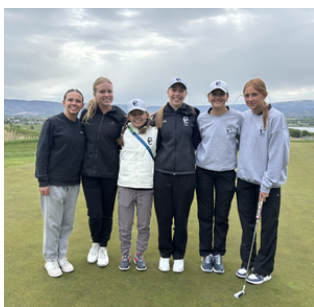
Girls Golf takes 4th in State