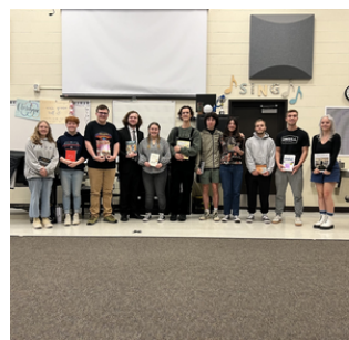
Senior Book Awards